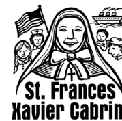
St. Frances Xavier Cabrini

founded 67 institutions. She was also the first to become a U.S. Citizen and the first U.S. Citizen to become Canonized. Not only did she tend to the poor & sick, but created lasting Institutions. Her Feast Day is Nov. 13th.